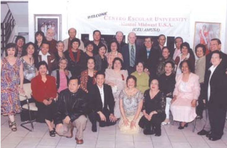
CEU alumni and friends in Chicago, Illinois, USA.